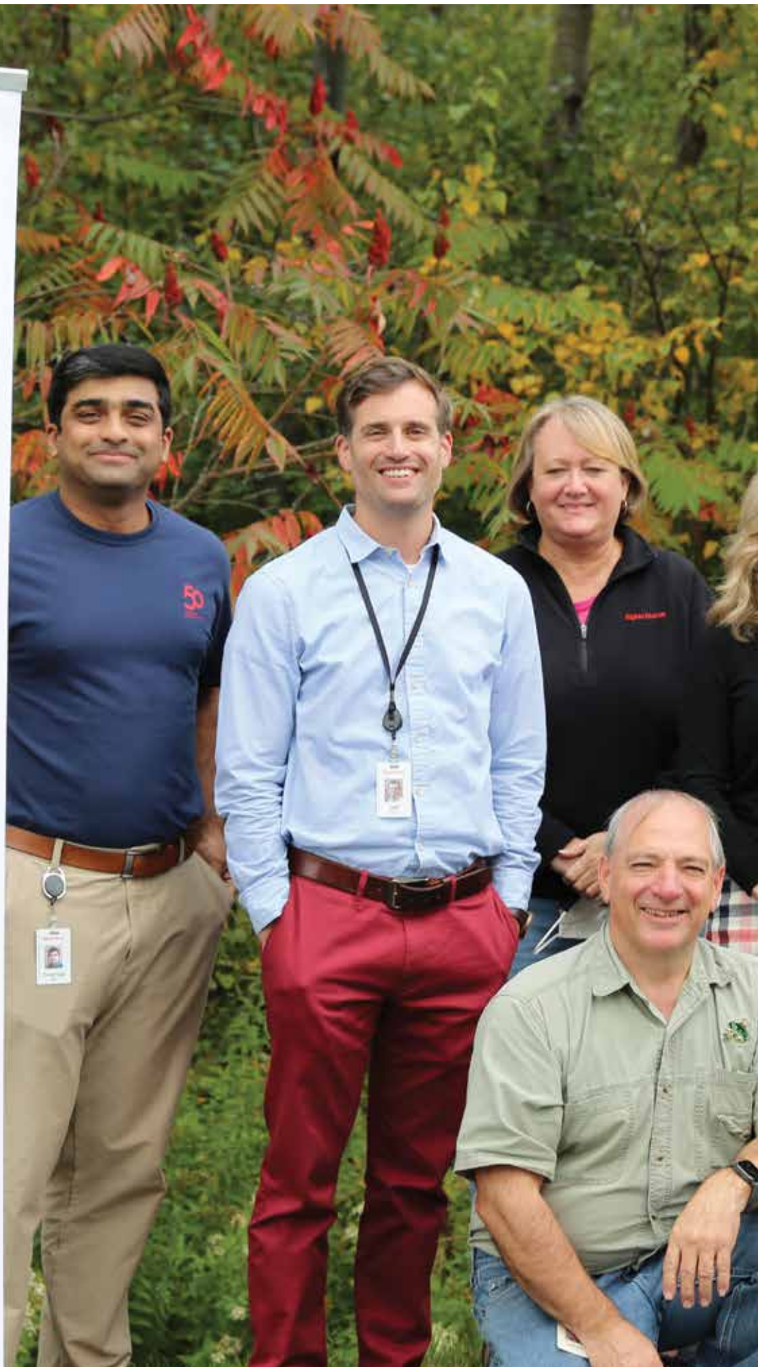
Upper Valley HOPE team.