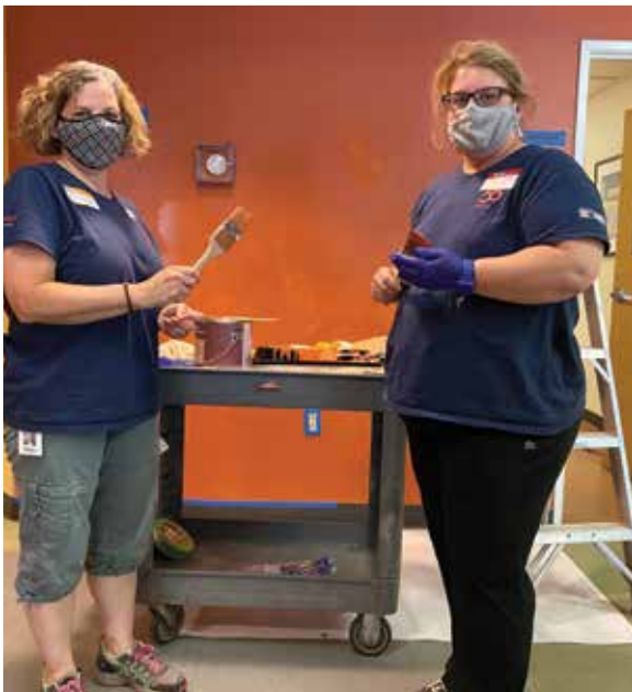
Clockwise from above: Middle school students on STEM tour of Hypertherm's Gold LEED manufacturing facility, 2019. FIRST LEGO Robotics New Hampshire qualifier competition, 2019. Associates help to install a playground at an early childcare center. HOPE Foundation staff paint at the Upper Valley Haven.

Those focus areas are STEM (science, technology, engineering, and math), substance-use disorder, and early childhood.