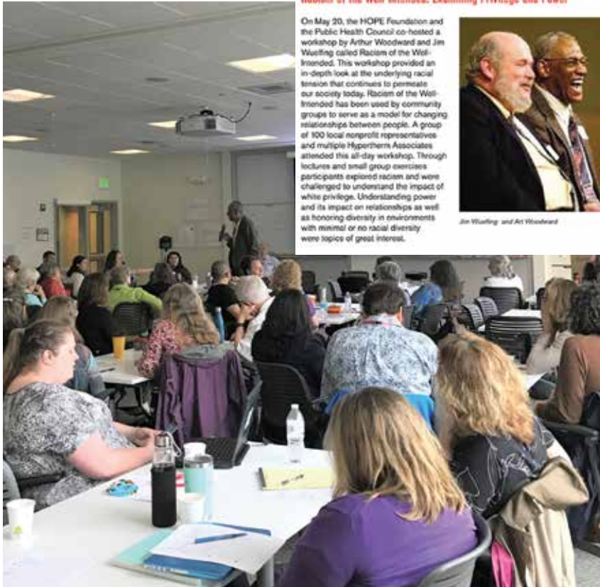
The 2019 HOPE Foundation-hosted workshop, Racism of the Well-Intended.

associates. In 2020, during a pandemic, associates volunteered more than 20,000 hours of community service. In 2019, 85 percent of associates volunteered their time. “They all breathe life into our core value of community leadership. The depths of compassion of our associates that fuel the work is incredible,” Jenny says.