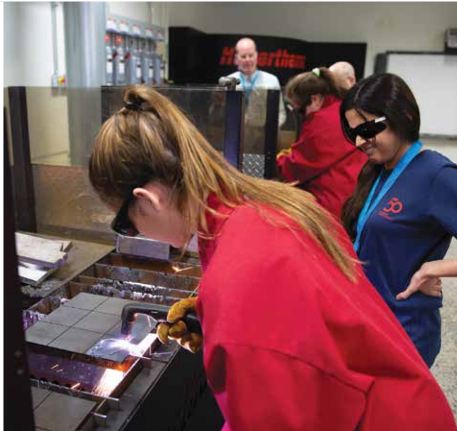
Clockwise from top: Project Search intern tour. Girls Technology Day plasma cutting, 2019. HOPE Foundation staff delivers Meals on Wheels in Lebanon.